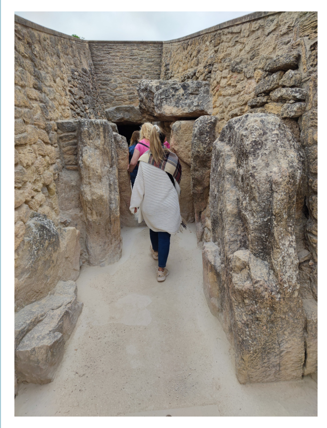
Study visit to Dólmenes de Antequera, the only UNESCO element in Málaga province (Cultural Heritage awareness and conservation)