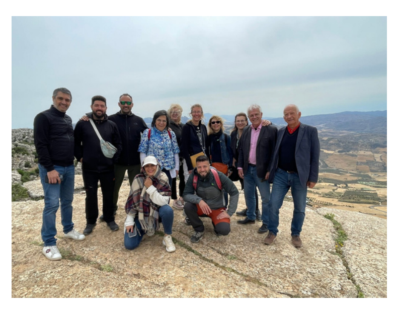
The group of participants of the Seminar