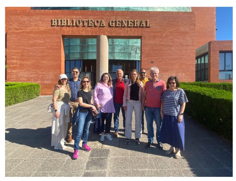
Study visit to the Main Library of UMA (Hosted by International Hub)