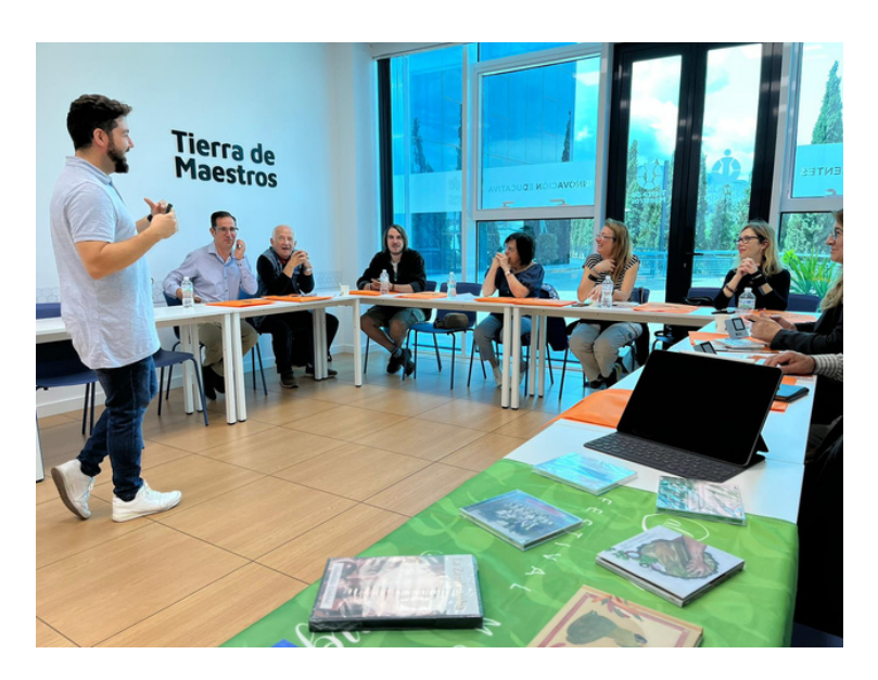
Educational Innovation Session in Tierra de Maestros