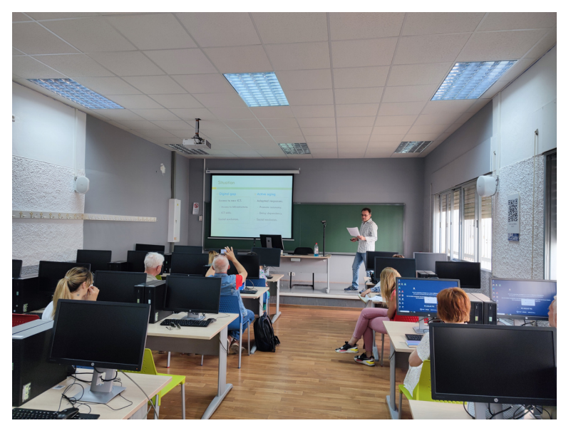
Active Aging and Digital Skills Seminar

In this seminar focused on the exchange of good practices, the main topics addressed were "Cultural heritage as a vehicle for social development" (TdM - Tierra de Maestros) and "Educational challenges for active ageing" (UMA - University of Málaga).