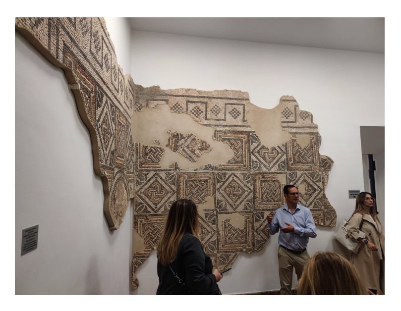
Study visit to the Archeological Museum in Antequera (Culture Heritage)